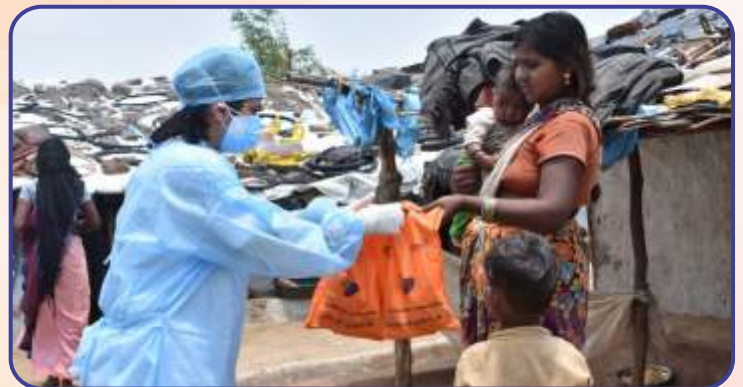
Distributing Covid-19 kits comprising of Face Mask, Sanitizer, Soap and Napkin to slum dwellers explaining its significance to avoid Covid-19 infection

He, who struggles, is better than he who never attempts.