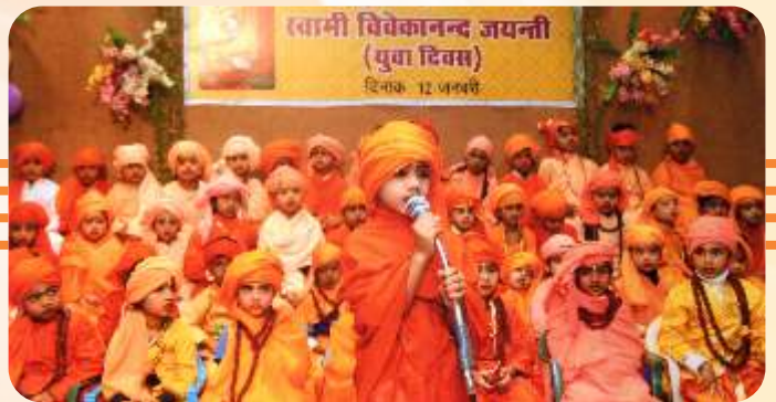
Students of Sadhu Vaswani School Celebrating Swami Vivekanand Jayanti (Yuva Diwas)