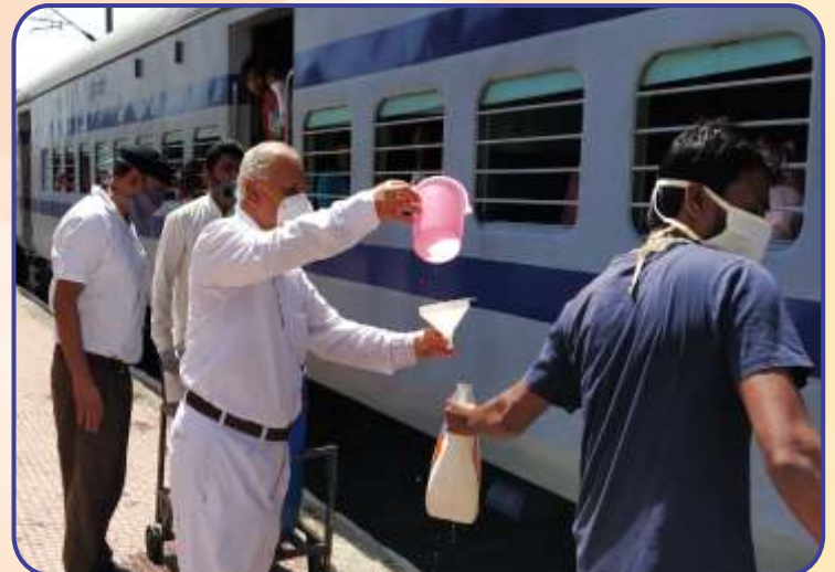
Serving water to the thirsty passengers of Special Shramik Train at Sant Hirdaram Nagar station.

The remedy for any type of weakness is not brooding over it; but thinking of strength.