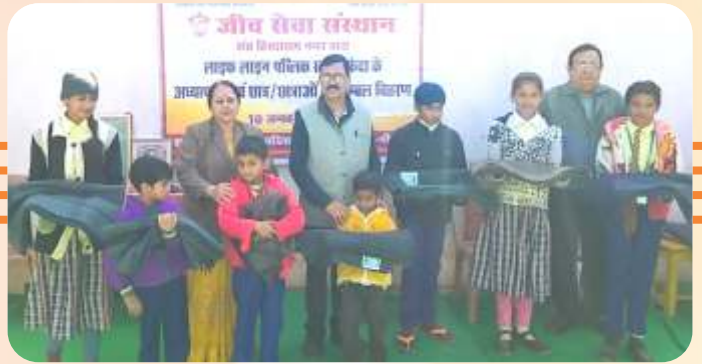
Providing blankets to needy children in Life Line Public School, Fanda