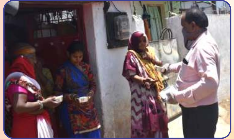
Distributing food packets to the poor during Covid-19 outbreak