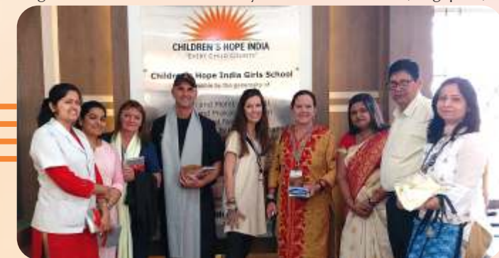
Felicitating the team of One Global Village, an NGO of USA, in CHI Girls School, Gandhinagar