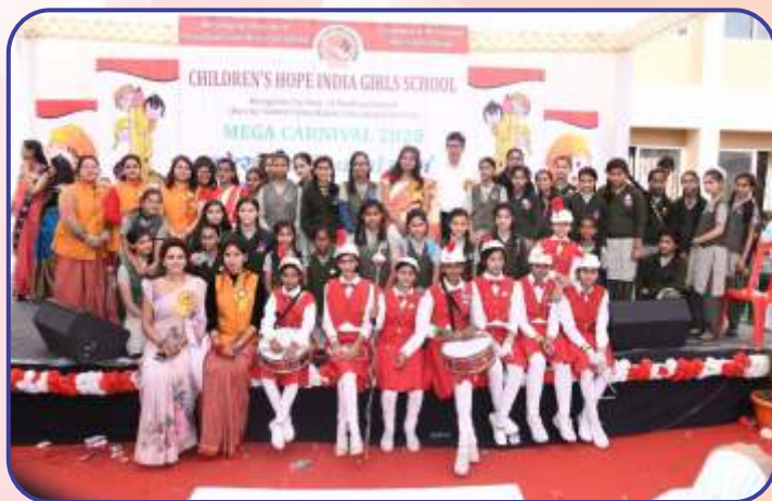
Sweet memory of Mega Carnival – 2020 organized in Children’s Hope India Girls School, Gandhinagar