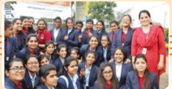
Students of SHIM organised a Medical camp in Naipaniya Sukha Village under unnat Bharat Abhiyan, a project by Ministry of HRD, Govt. of India.