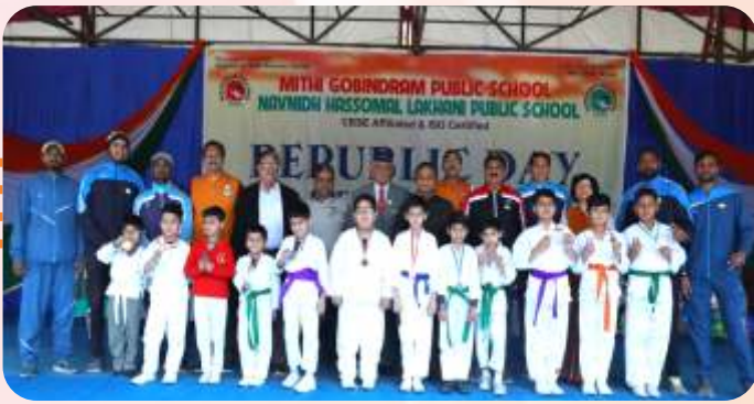
Students of Mithi Gobindram Public School honoured in Republic Day Celebration for performing in various sports