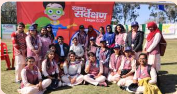
Sant Hirdaram Girls College awarded as the Cleanest College of the city by Municipal Corporation, Bhopal.