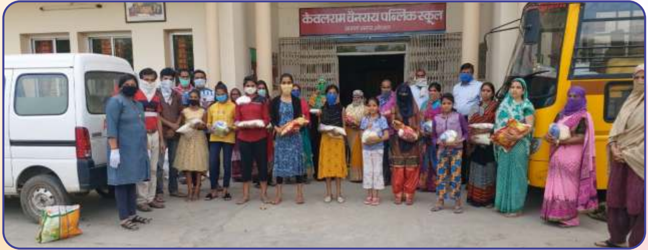
Providing ration to the needy families to combat Covid-19 pandemic situation

One thing that has been made clear to the global community by the corona-virus is that all of us are radically inter-dependent; that no person or country is an island unto himself or itself; and that our common survival is intimately bound up in the welfare of our needy & less-privileged brethren.