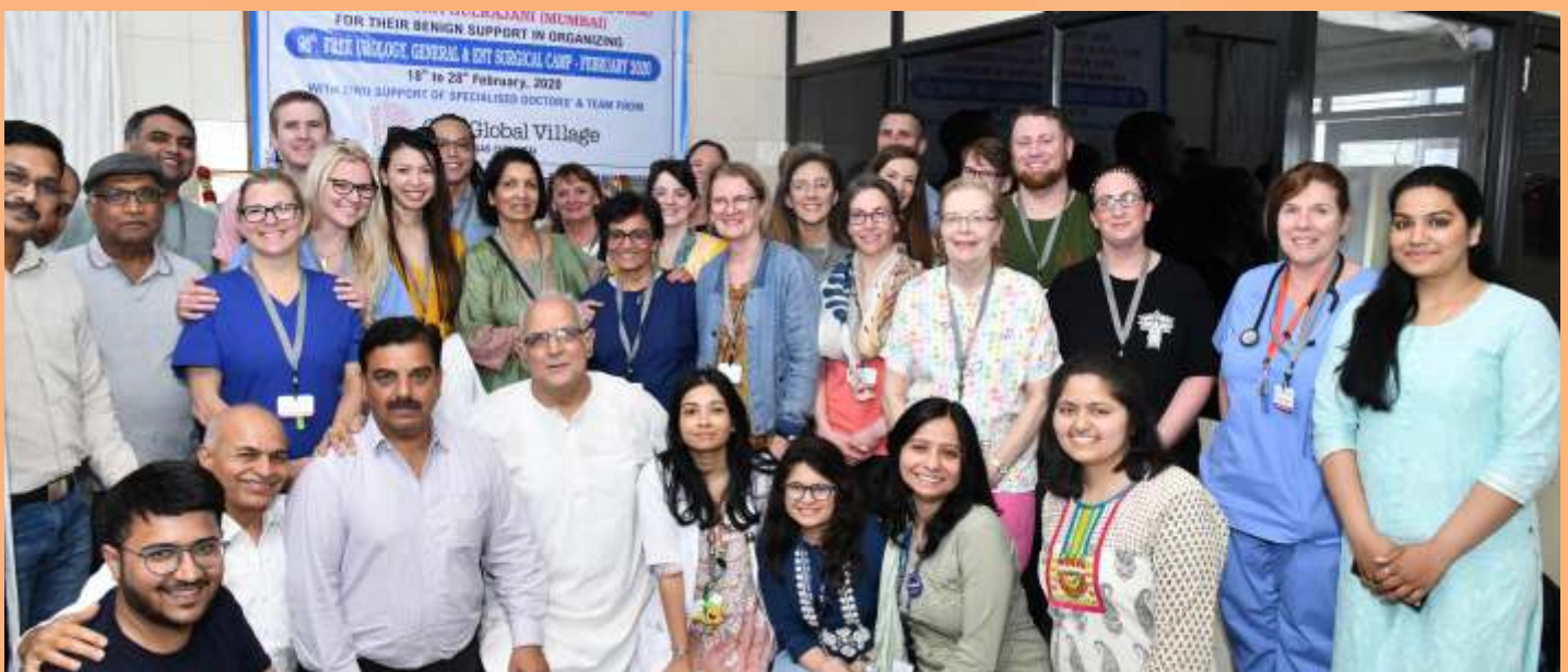
Dedicated team of One Global Village (Kansas City, USA), comprising of doctors, surgeons, paramedical staff & volunteers, who rendered their honorary services in 96 th Mega Free Urology / ENT / General Surgery Camp.