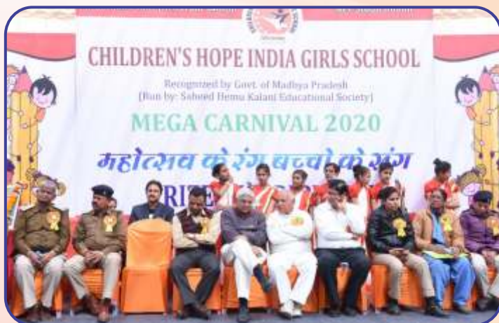
Mega-Carnival 2020 organized in Children’s Hope India Girls School, Gandhinagar