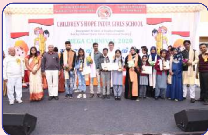
Felicitating meritorious students alongwith their parents in Mega-Carnival 2020