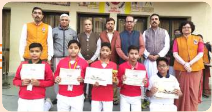
Students of MGPS Shine in 'BHARAT KO JAANO' Quiz Contest (News on Page 17)