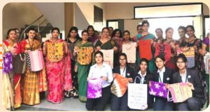
Plastic Free Society Awareness Campaign by the students of Sant Hirdaram Institute of Management (News on Page 18)