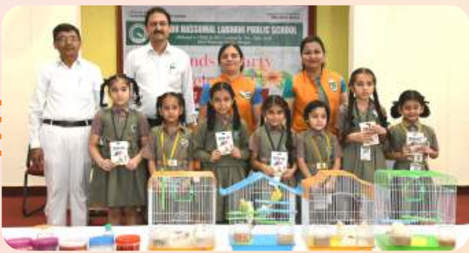
Students of Navnidh Hassomal Lakhani Public School organized 'To be meatless compaign' (News on Page 16)