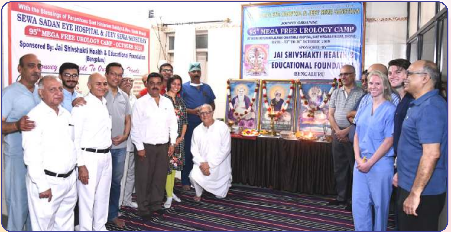
Inauguration of 95 th Mega Free Urology Camp in the gracious presence of Doctors & Volunteers